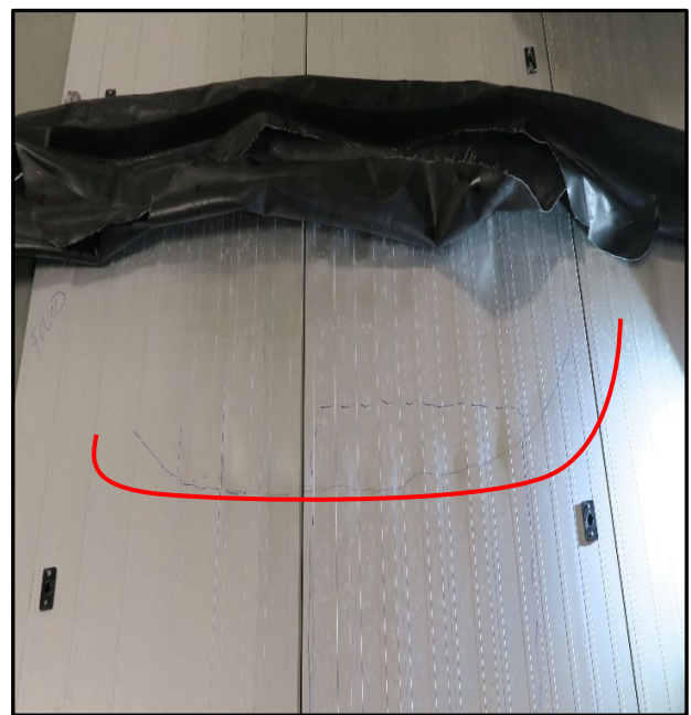
Figure 2 – Ruptured keel bladder and the view of the underside of the metal hull. The red line has been added to highlight the deformities in the hull metal due to the keel bladder rupture.

An investigation has identified that the keel bladder suffered a rupture due to excessive pressure in the tube. The recommended operating pressure by the manufacturer is 3.4 pounds per square inch (p.s.i) or 240 millibar pressure (mb). An on-scene survey of multiple inflatables on board the cruise ship noted pressures up to and exceeding 9 p.s.i. (620 mb) in other keel bladders. The keel bladder is not protected by a safety relief valve, and the manufacturer recommends that they be inflated with a foot pump to reduce the chance of over-pressurization. However, crewmembers were routinely using an air compressor to fill the buoyancy chambers (including the keel tube) prior to the incident. In addition, pressure levels were not being checked using a manometer as recommended by the manufacturer.